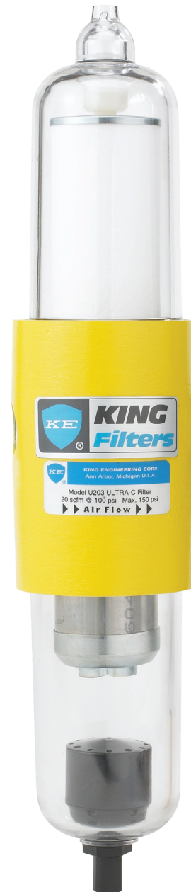
Model U203 Ultra-C Compressed Air Filter

(An available variation, model U202 is the same unit but with a manual petcock drain.)