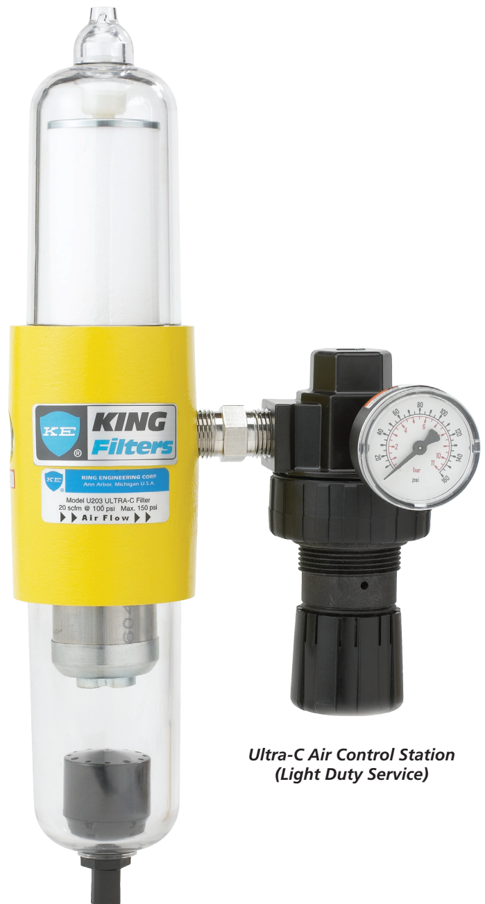
Ultra-C Air Control Station (Light Duty Service)

KING U205 Air Control Stations are intended for light duty environments not directly exposed to salt water and/or prolonged direct sunlight exposure. The U205 has an aluminum housing with polycarbonate sumps, while the regulator is supplied with cast zinc body. Inlet and outlet connections are 1/2" NPT designed to accept standard tube or pipe fittings.